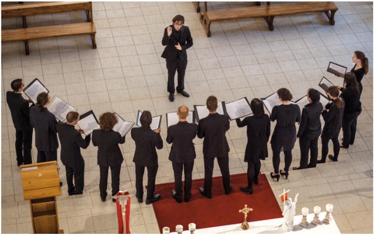
Vocalino Wettingen (Switzerland)

During the evening concert choirs gave a very nice and warm concert in the beautiful church of the Virgin Mary of the Immaculate Conception in Šiauliai. Next year the Šiauliai Cantat festival and competition will change its dates from the end of May, to the beginning of October. Choirs are welcome to participate in the event on 4-7 October 2018. Organisers are expecting ever more high quality choirs from different countries to be interested in Šiauliai Cantat event. During the past year's festival and competition there were choirs from Latvia, Estonia, Poland, Russia, Belarus, the Czech Republic, Switzerland, Germany and the United States of America.